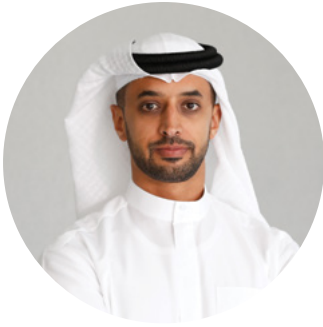
Ahmed Bin Sulayem

Executive Chairman and Chief Executive Officer, DMCC